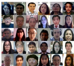
28-30 September, 2020, Virtual IOP Conference Series: Earth and Environmental Science Volume 505