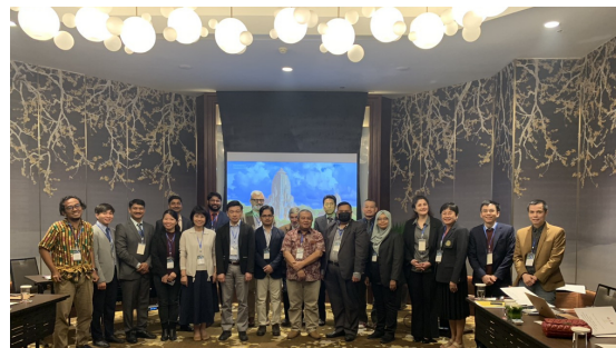
24-26 February, 2023, Hybrid Conference (Hanoi, Vietnam) Springer Book Series Earth and Environmental Sciences