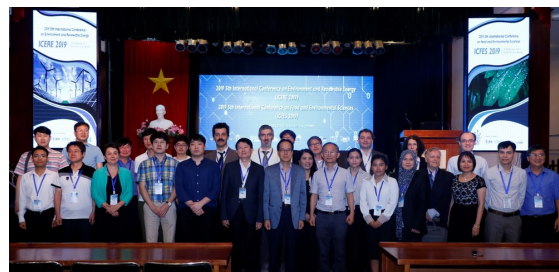
25-28 February, 2019, Ho Chi Minh City, Vietnam IOP Conference Series: Earth and Environmental Science Volume 307