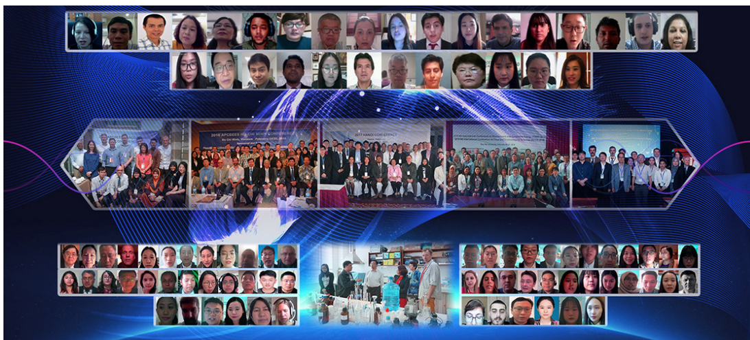
25-27 February, 2018, Da Nang, Vietnam IOP Conference Series: Earth and Environmental Science Volume 159